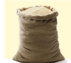
Bag of rice