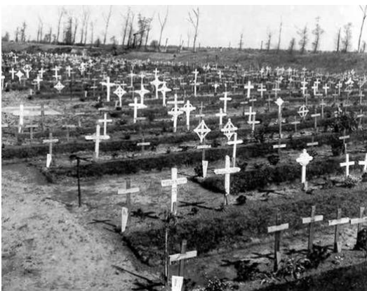
Essex Farm Cemetery - then