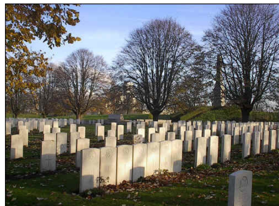
Essex Farm Cemetery – now