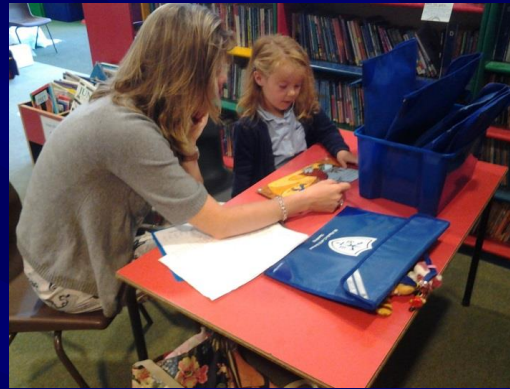
Volunteers for hearing children read