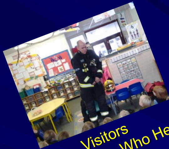
Visitors (e.g. People Who Help Us topic)