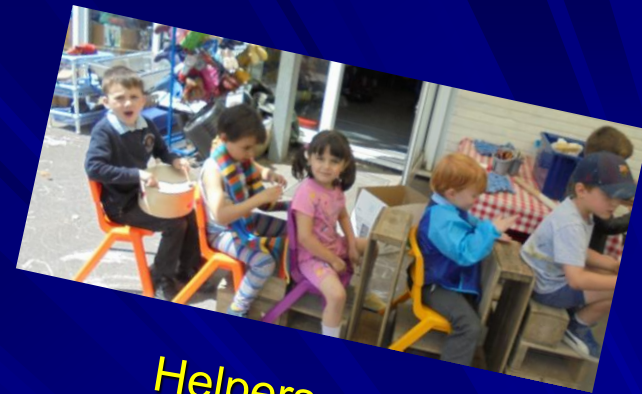
Helpers on trips

How can you get involved with your child's learning?