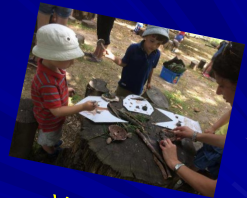
Volunteers for small group work