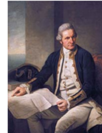
Captain James Cook