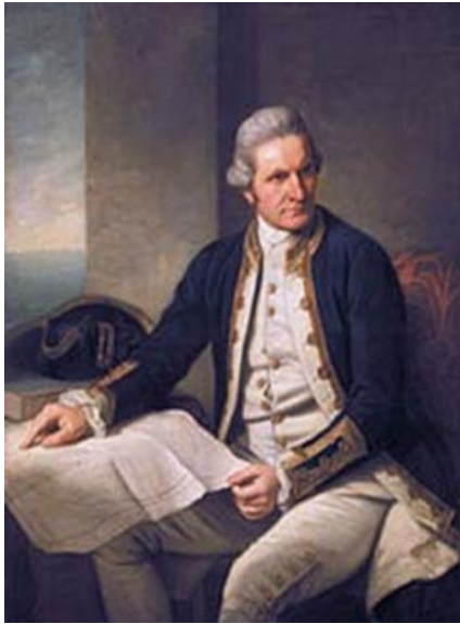
Captain James Cook