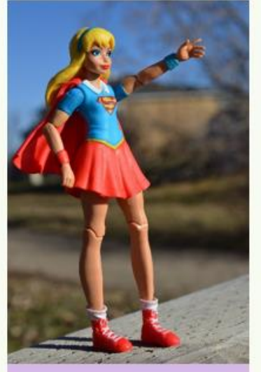
Supergirl showed the way – despite being completely lost – to find the villains.