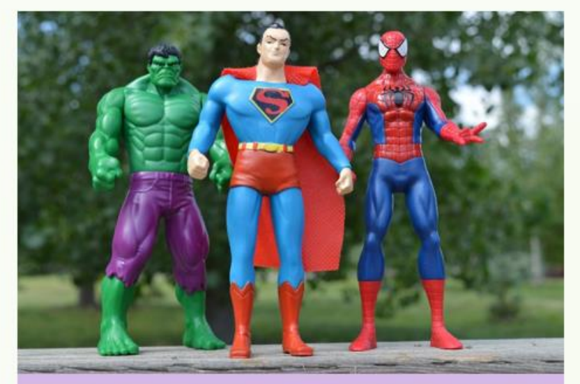
Ready for action, Superman (wearing his trademark red cape) called his friends to join him in the fight against evil.

Write sentences about these pictures where you add a parenthesis: