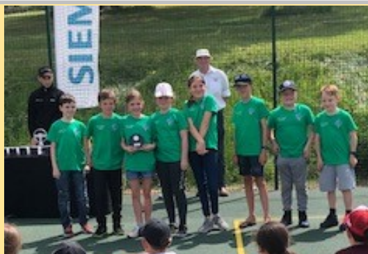
GreenPower receiving their award last Saturday—see over for more details.