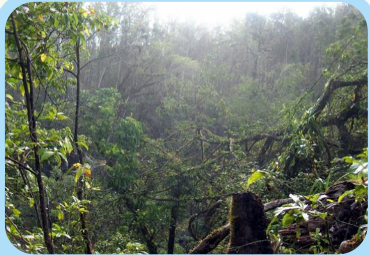
Photo courtesy of Rob and Stephanie Levy (@wikimedia.org) - granted under creative commons licence - attribution

Photo courtesy of Chris Fithall (@flickr.com) - granted under creative commons licence - attribution