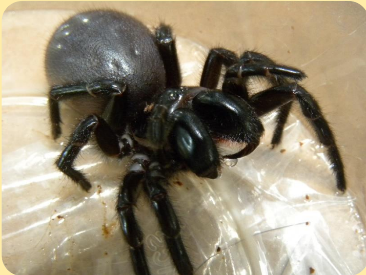
Sydney funnel web spider