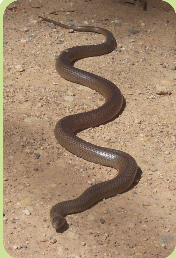
eastern brown snake