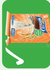
Cardboard cereal boxes