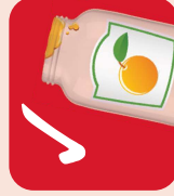
Food on packaging