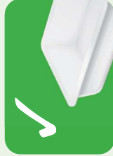
Clean plastic food trays