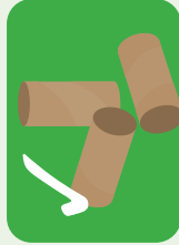
Toilet roll tubes